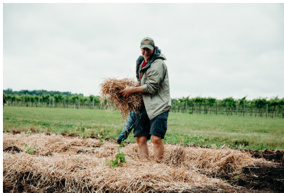
Mulching newly planted strawberries with straw.

Materials: Cornell Guide to Growing Fruit at Home resource (found in GBL library)