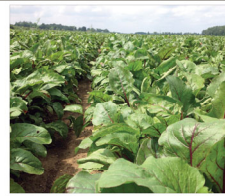
2019 Cornell Integrated Crop and Pest Management Guidelines for Commercial Vegetable Production